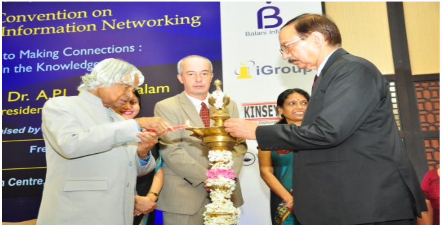
Hon'ble Dr. A.P.J. Abdul Kalam, Former President of India inaugurating NACLIN 2014

The 17 th National Convention on Knowledge, Library and Information Networking – NACLIN 2014 jointly organized by DELNET-Developing Library Network and French Institute of Pondicherry, Pondicherry was inaugurated on December 9, 2014 at Hotel Anandha Inn Convention Centre, Pondicherry by Hon'ble Dr A.P.J. Abdul Kalam, Former President of India.