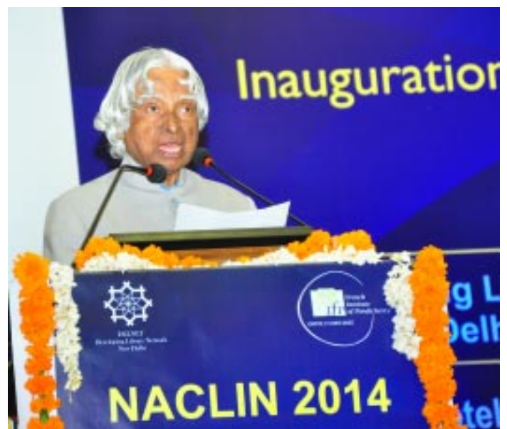
Hon'ble Dr. A.P.J. Abdul Kalam, Former President of India

NACLIN 2014 is supported and sponsored by organizations including RRRLF, ICSSR, DRDO, ICCR, Cengage Learning India Pvt Ltd, Balani Infotech/I Group, Kinsey Bros, Taylor and Francis