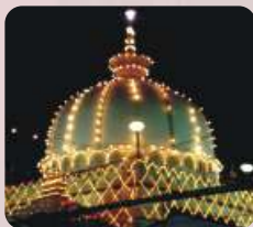
Khaja Bande Nawaz