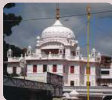
Guru Nanak Jhira