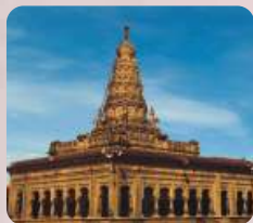
Sri Sharanabasaveshwar Temple

Gulbarga is an educational hub comprising of State and Central University, four Medical and two Dental Colleges, five Engineering Colleges and one Homeopathy and Ayurvedic Colleges and many Degree Colleges. It was the capital city of Bahamani kingdom and one of the most famous historic cities of Karnataka state with tourist attractions like Shri Sharanabasaveshwar Temple, Khaja Bande Nawaz Darga, Buddhavihar, Nagavi (the first University established), Mitakshara - Martur village (22 kms), Lord Dattatreya - Ganagapur (60 km), Basavakalyan (80 km), Gurunanak Jhira, Narasimha Jhira and the oldest Madarasa of Mohammed Gawan in Bidar (100 km), Golgumbaz in Bijapur (165 km), Mantralayam (200 kms) etc.